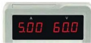
Conventional display example

2. Constant power design provides a combination of multiple ranges of voltage and current settings, allowing flexible configurations of higher voltage and larger current for users within the rated power range.